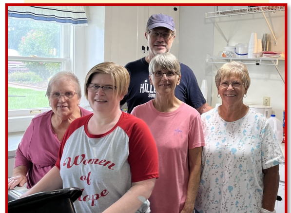
Here's part of The Meatball Crew -- coming for YOU!